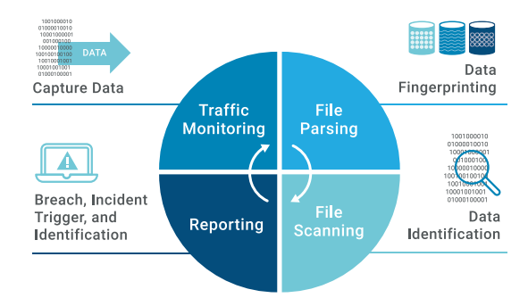
Figure 2: Flying Cloud CrowsNest performs continuous traffic monitoring, file parsing, file scanning, and reporting to build a Rolling Baseline of normal data, device, and user activity.